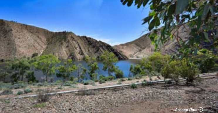
Aroona Dam