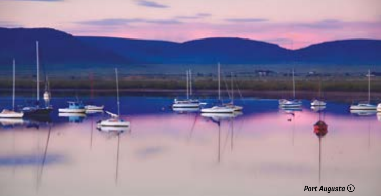
Port Augusta ©